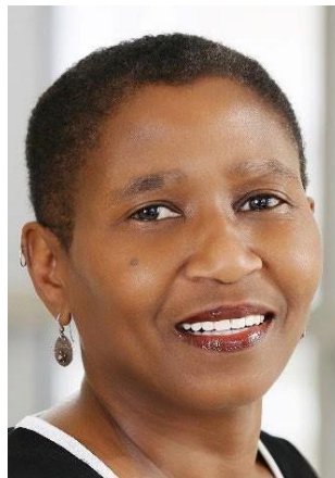
MICHELE ROBERTS former Executive Director of the National Basketball Players Association