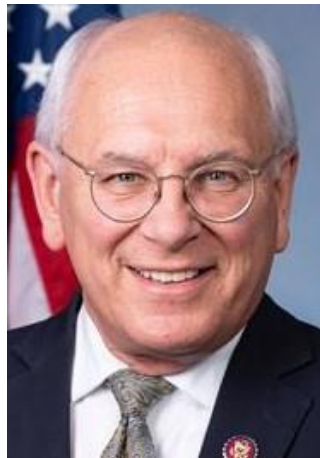
THE HONORABLE PAUL TONKO, U.S. Representative for 20 th Congressional District of New York, author of The Safe Bet Act