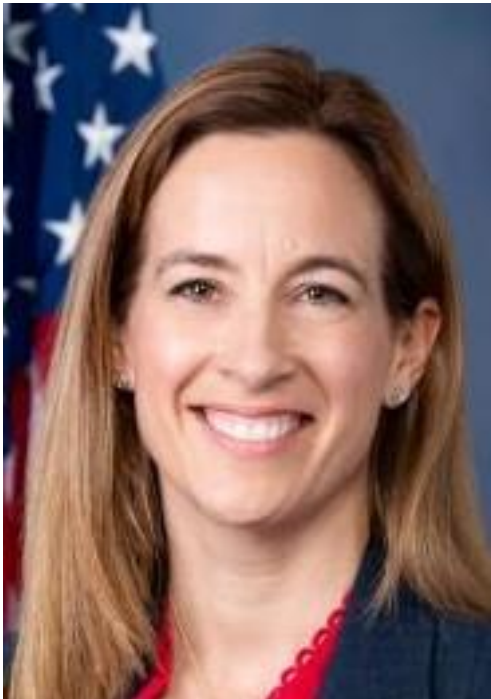
THE HONORABLE MIKIE SHERRILL United States Representative 11 th District of New Jersey

Honoring an elected public official responsible for advancing legislation that would significantly improve the conduct of intercollegiate athletic programs, enhance the rights of college athletes, or otherwise protect their education, health and safety.