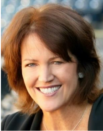
CHRISTINE BRENNAN USA Today, CNN, ABC News, PBS NewsHour, NPR

What are the economic drivers of college sports and how do they affect athlete education? The NCAA's Division I athletics enterprise generates $15.8 billion in annual revenues of which only $2.9 billion -- 18.2 percent -- is returned to athletes in the form of athletics scholarships and only 1 percent is spent on medical treatment and insurance protections, while 35 percent is spent on administrative and coach compensation and 18 percent on lavish facilities. Will a redistribution of expenditures address unacceptable academic outcomes or the long-term impact of athletic injuries?