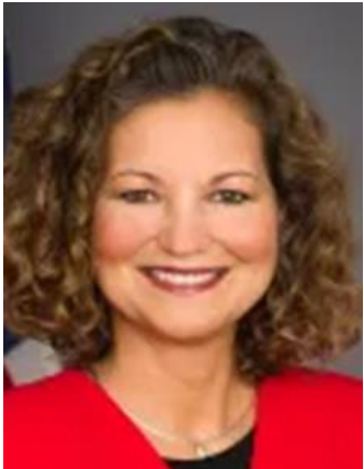
JENNIFER ABRUZZO, General Counsel, National Labor Relations Board

What are the economic drivers of college sports and how do they affect athlete education? The NCAA's Division I athletics enterprise generates $15.8 billion in annual revenues of which only $2.9 billion -- 18.2 percent -- is returned to athletes in the form of athletics scholarships and only 1 percent is spent on medical treatment and insurance protections, while 35 percent is spent on administrative and coach compensation and 18 percent on lavish facilities. Will a redistribution of expenditures address unacceptable academic outcomes or the long-term impact of athletic injuries?