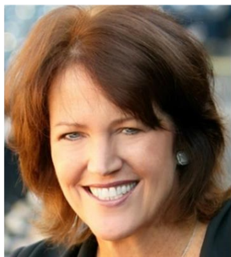
Christine Brennan USA Today, CNN, ABC News, PBS NewsHour, NPR Columnist, Author

Moderated by National Award-Winning Journalists