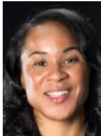
DAWN STALEY Head Women's Basketball Coach, University of South Carolina, 2017 and 2022 NCAA Division I Champions; USA Women's National Team Player and Coach, WNBA All-Star